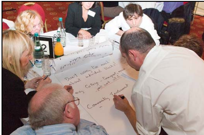
Members of the Oldham Partnership playing an active role in the development of the Local Area Agreement and the Partnership during the workshop sessions.